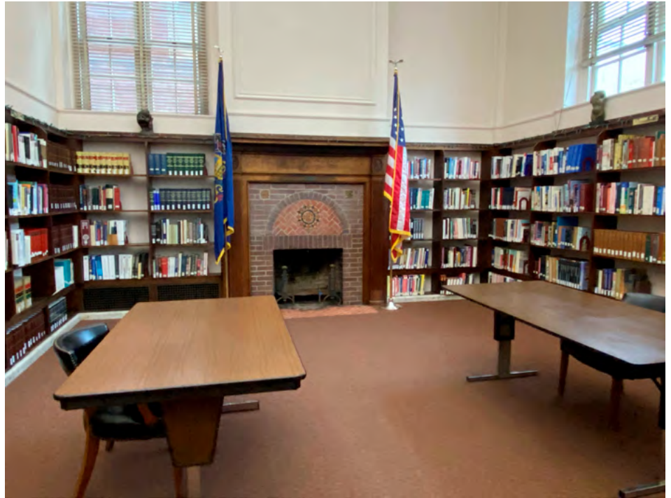
Reading areas with reduced furniture to provide social distancing.

Continued social distancing concerns mean it will be a while before libraries are again the bustling centers of community activity, full of story time tots, book clubs, and study groups. Through remarkable fortitude, creativity, and resilience during this crisis, librarians and library staff have worked to restore service without the benefit of physical buildings and materials. Libraries have continued to serve their communities by offering digital collections, video-conference book clubs, recorded and broadcast story times, webinars, and online consulting. As libraries around the globe begin to reopen and provide traditional services, these new virtual ways of connecting and communicating will no doubt, become an ever more important part of the library landscape in service to their communities.