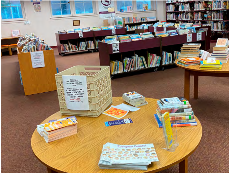
Children's area of the library with furniture and toys removed and proper signage posted regarding handling of the library materials.

In July, the FDLP held a webinar titled, “Planning for Reopening: FDLP Libraries Recovering from the COVID-19 Pandemic.” The webinar featured staff members from GPO, along with the Depository Library Council, and presented services and resources available including a COVID-19 FDLP Toolkit. GPO’s available products in the Toolkit include FDLP facemasks; signage; and posters on handling of books and library materials, social distancing, coronavirus and flu prevention, room capacity notification, and best practices for proper mask use. The webinar finished with a forum to discuss reopening challenges, services, staff health and safety, and more.