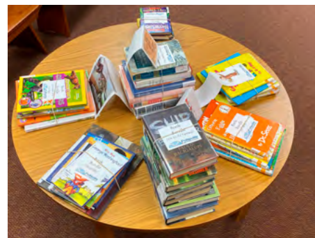
Book Bundles of children's books for parents/children to “grab and go” according to various topics.