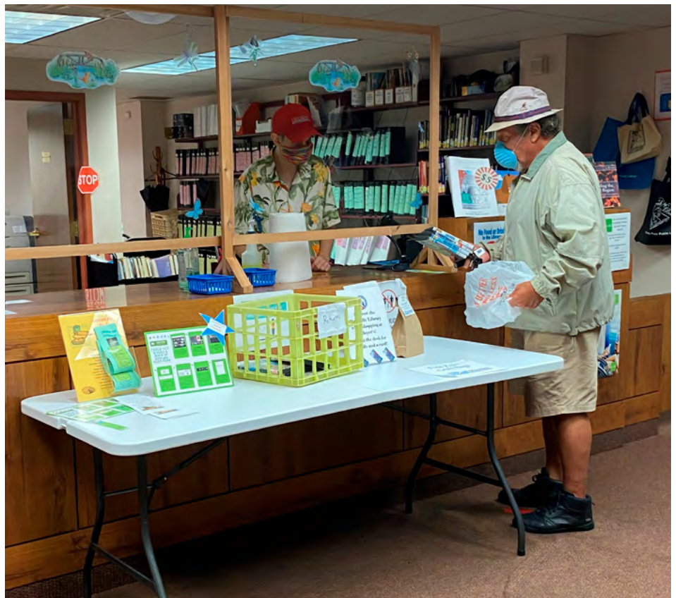
Library patron returns items to the library for 3 day quarantine. The Pottsville Free Public Library opened its door for the first time November 9, 1911, in a 3 story building with the facade modeled after Independence Hall in Philadelphia.