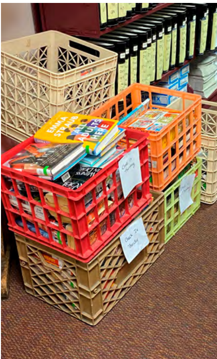
Returned books placed in quarantine for 3 days prior to re-shelving in library.