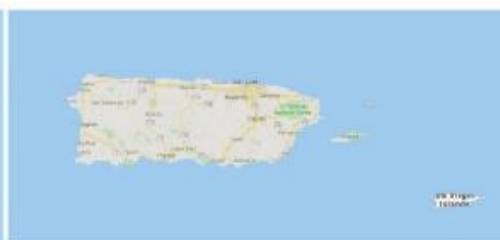
Puerto Rico and Virgin Islands