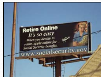
Billboard: Columbia, SC Atlanta Region