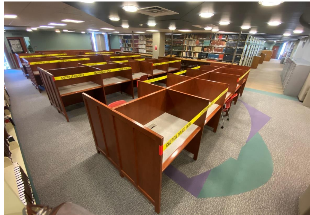
Floor 4 documents area in de-densified Milner Library