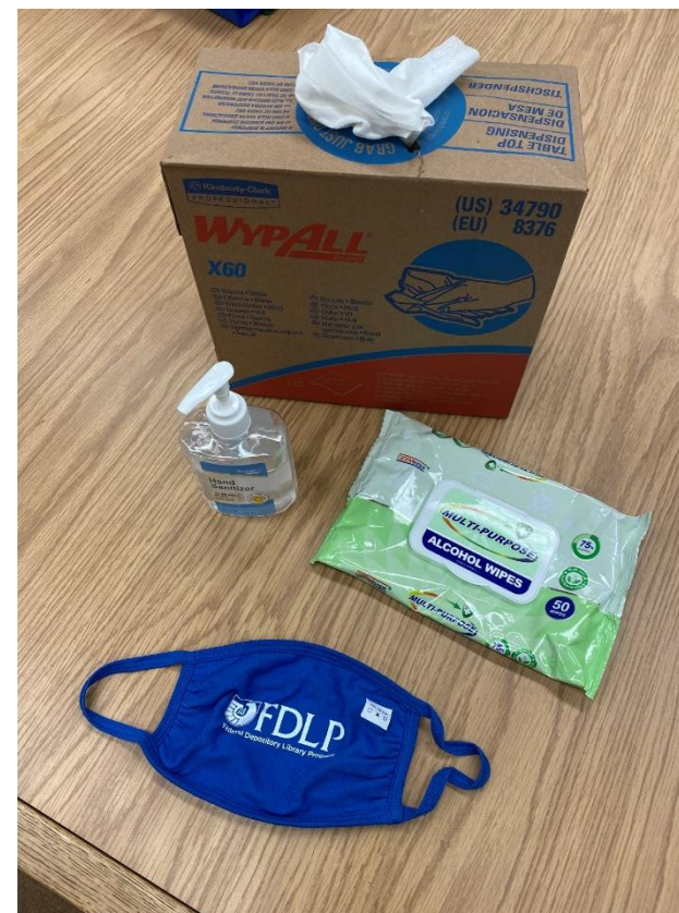
Workroom for documents department, Milner Library