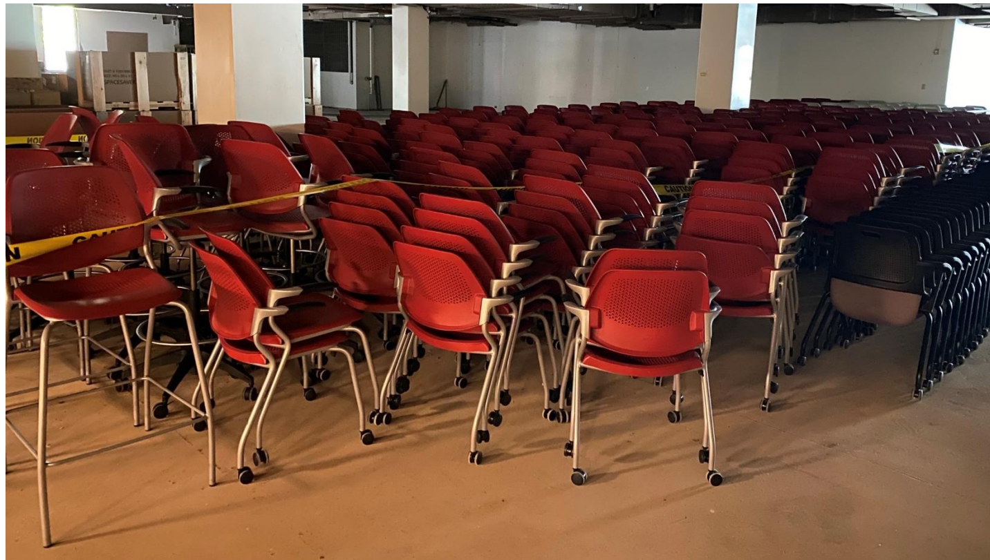
De-densified chairs relocated to nonpublic space, August 2020