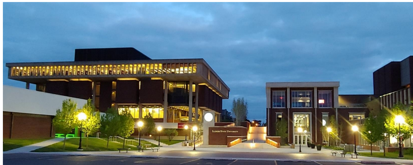
Illinois State University, Milner Library

Since 1997 all depository monograph records cataloged through Marcive