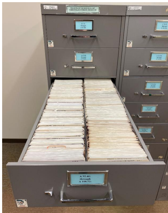
Department of Agriculture microfiche