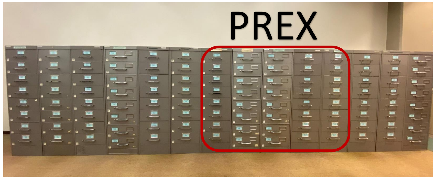
Depository microfiche cabinets; many drawers of PREX mfiche await work