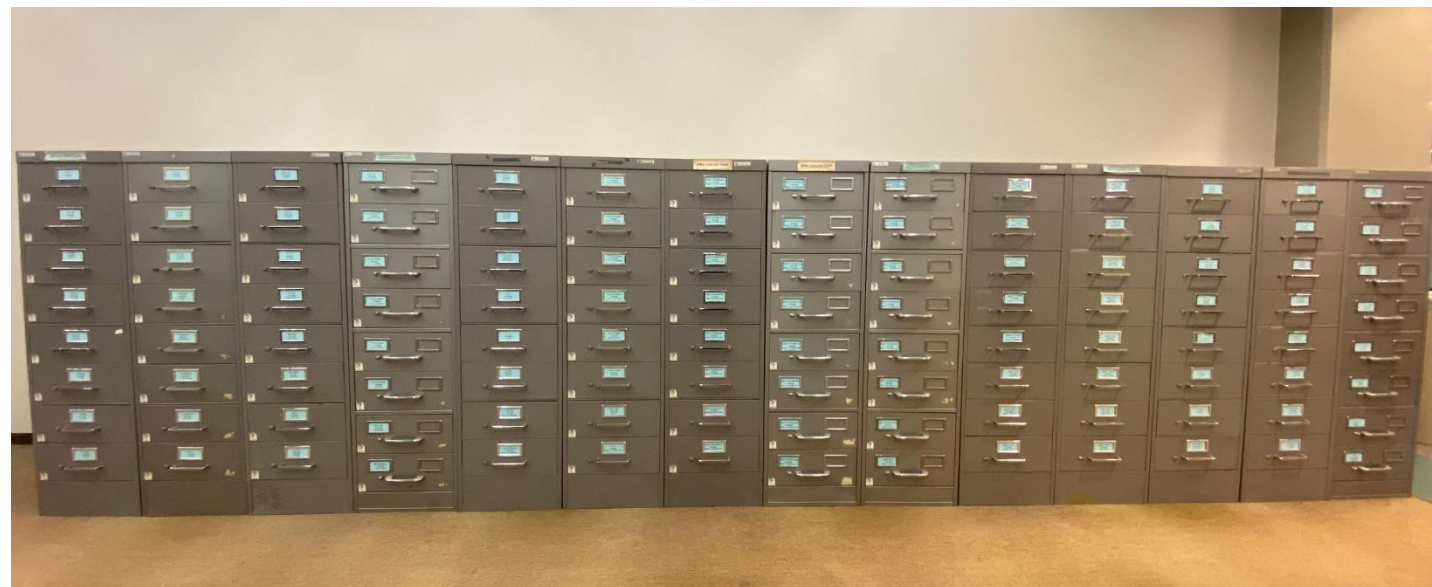
Depository microfiche cabinets