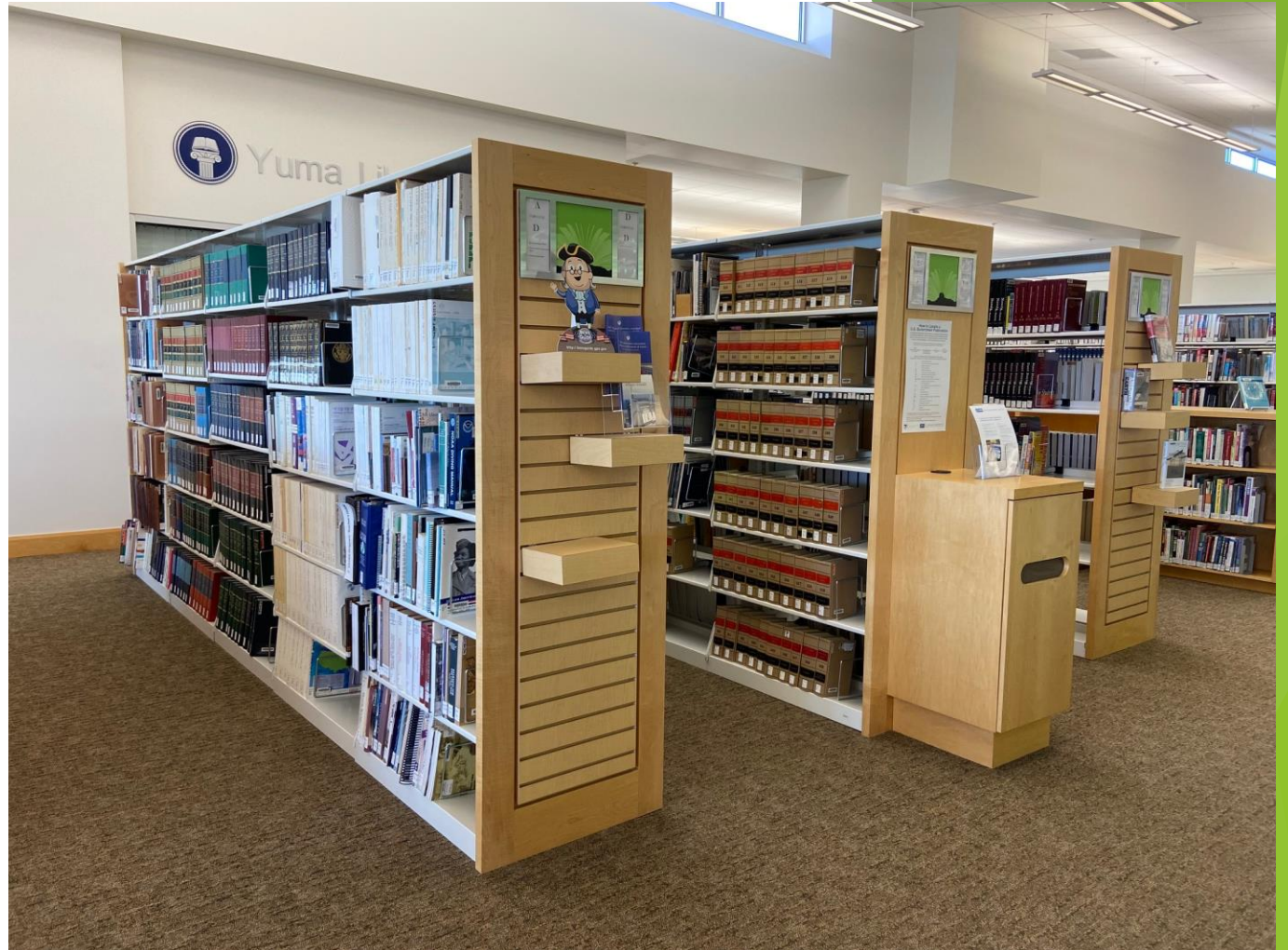
Yuma Main Library's FDLP Collection