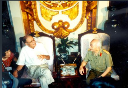
McNamara and Gen. Giap in Hanoi June 1997