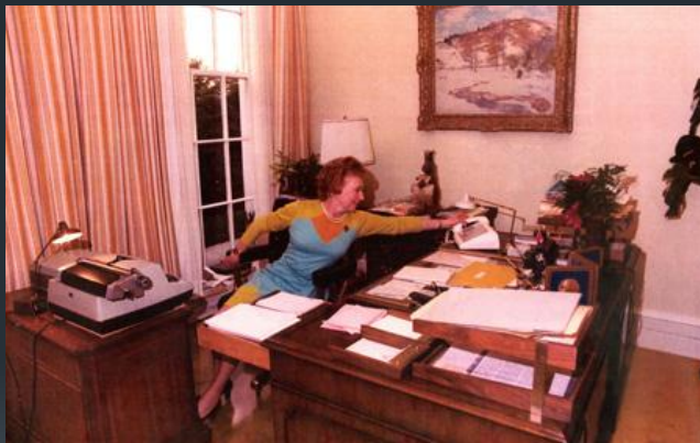
“Rosemary Award” for Worst Open Government Performance