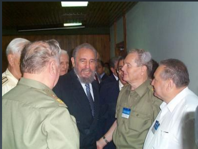
Castro and ex-Soviet friends in Havana October 2002