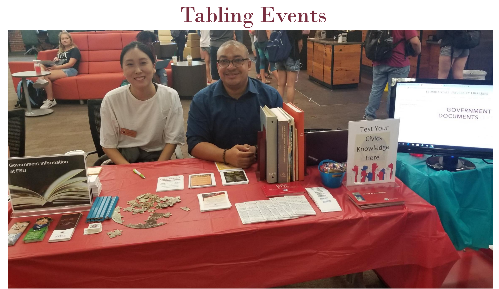
Government Information table at the Dirac STEM Library's open house event

The diversity of our outreach initiatives enable us to reach wider audience of patrons from the FSU and Tallahassee Community. This promotes our collections and services in very unique ways.