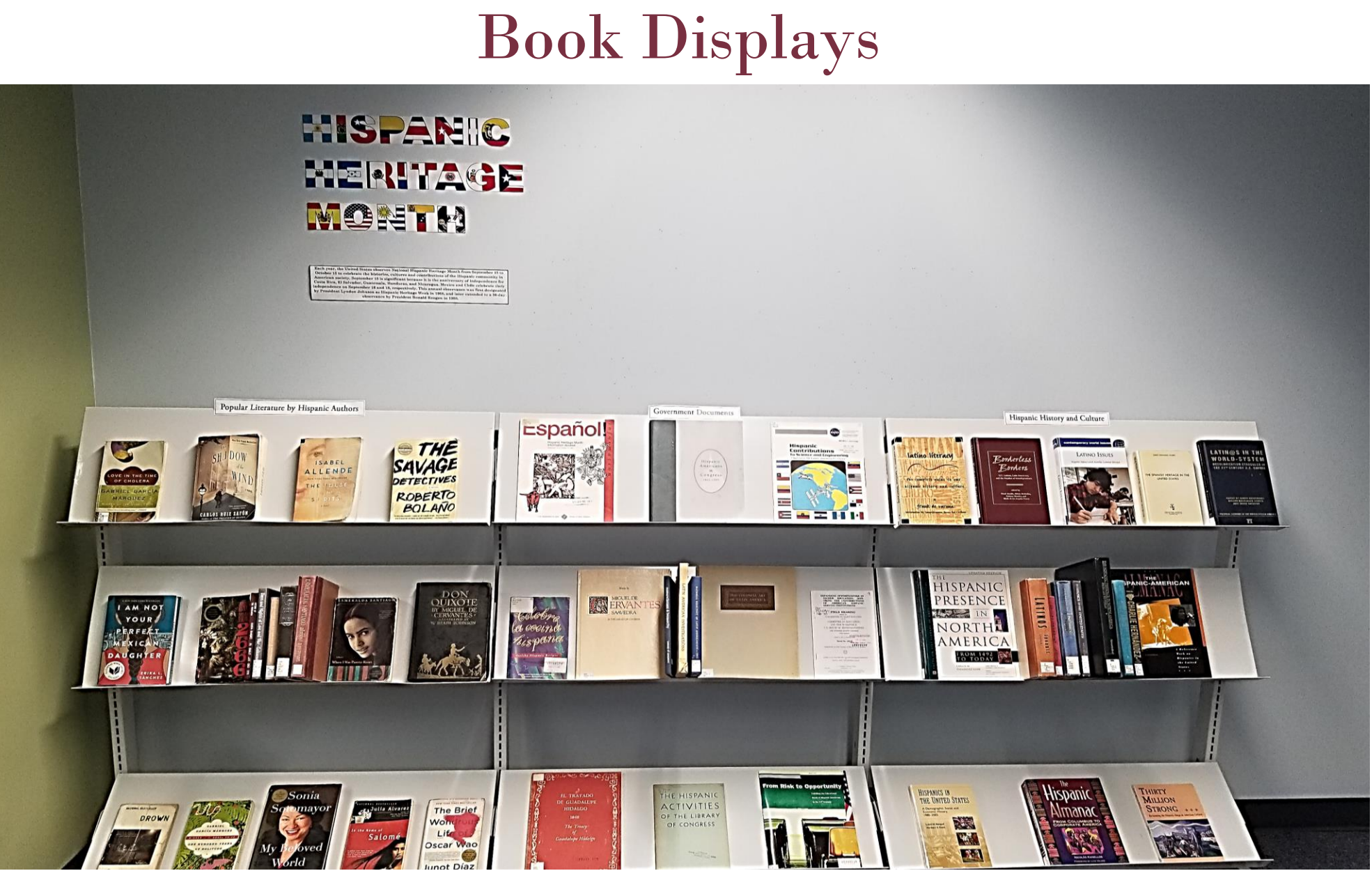
A book display for Hispanic Heritage Month with three themes: Popular literature by Hispanic authors, Government documents, Hispanic history and culture

Our very interactive engagement board is located in the Learning Commons on the 1st floor entrance of Strozier Library. The engagement board gauges research interests on campus, and sensitizes the campus community about national celebratory themes, such as Constitution Day. For this year's Constitution Day celebrations, we asked patrons about the part of the Constitution that affects their everyday life. This activity provides collaborative opportunities with the Learning Commons Department, and empowers civic participation by students. The Amendments to the Constitution were displayed next to the engagement board.