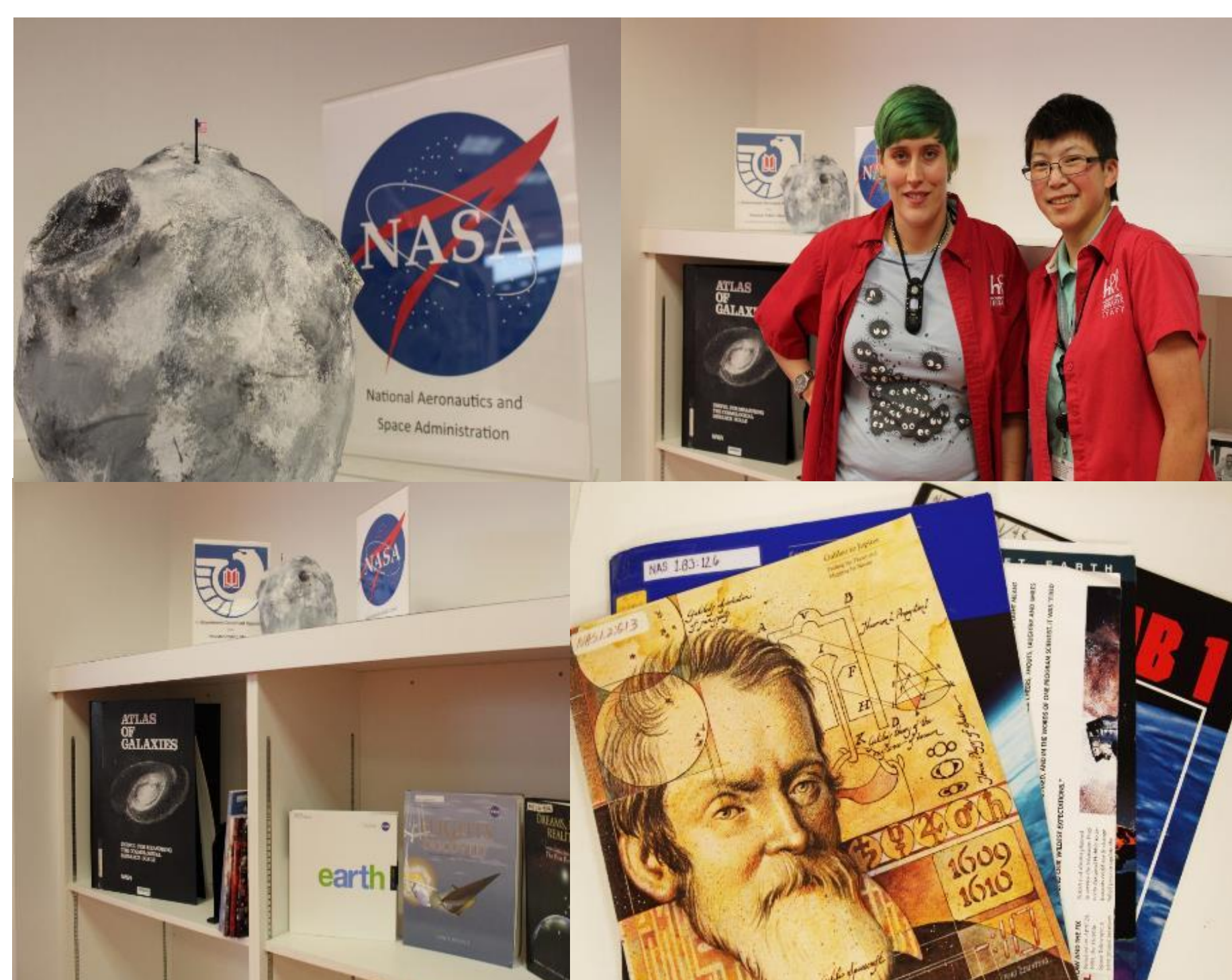
NASA Display in July promoting space, travel and science technology