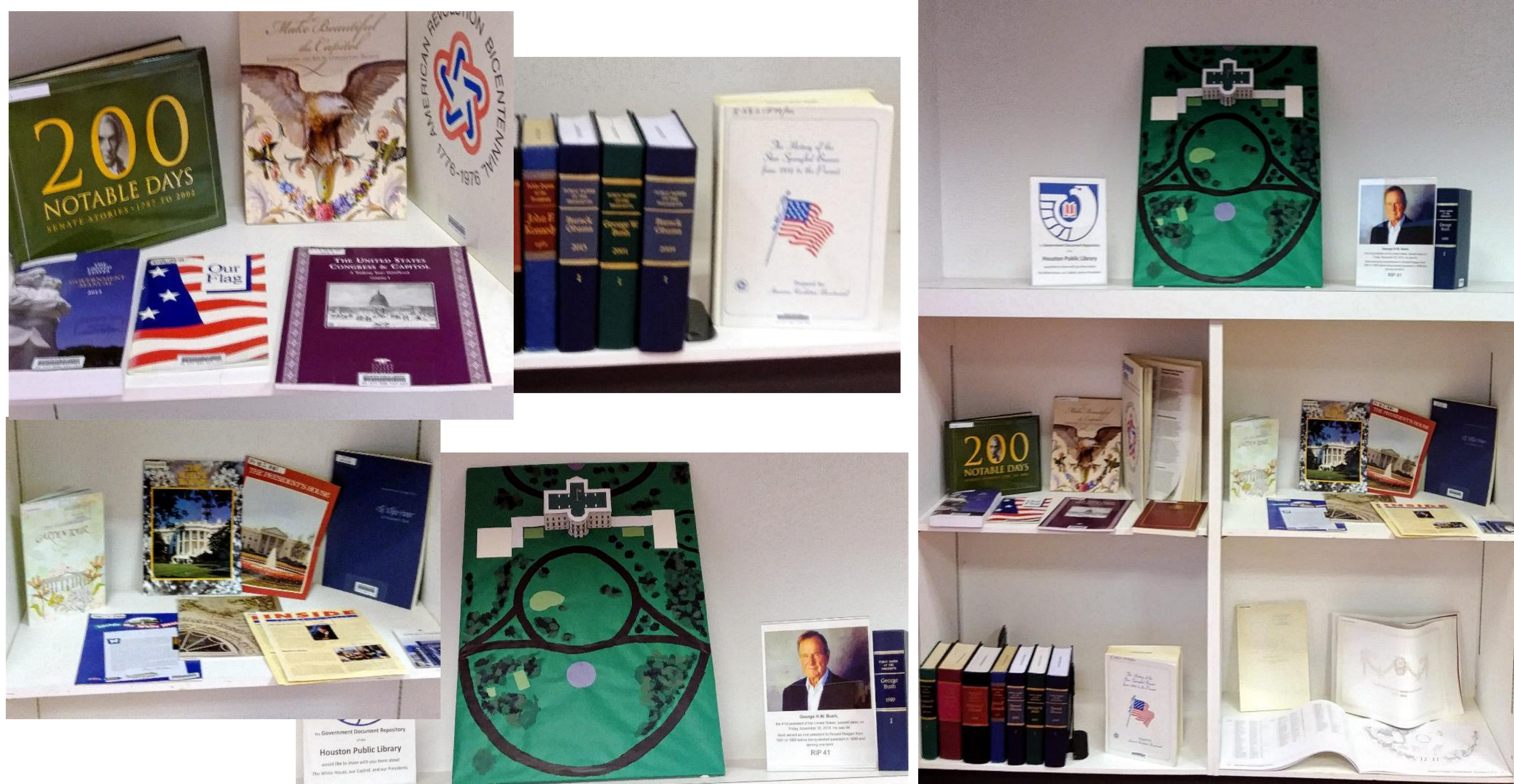
Did you know that the White House has a garden? That Each president has had their papers published? Book display celebrating Presidents' Day

Former President George H.W. Bush was remembered in Houston on Thursday, November 30 th , 2018 as a man of humility, honor and humor. To commemorate this family in Houston, we displayed numerous materials related to presidential papers, the White House and other related materials.