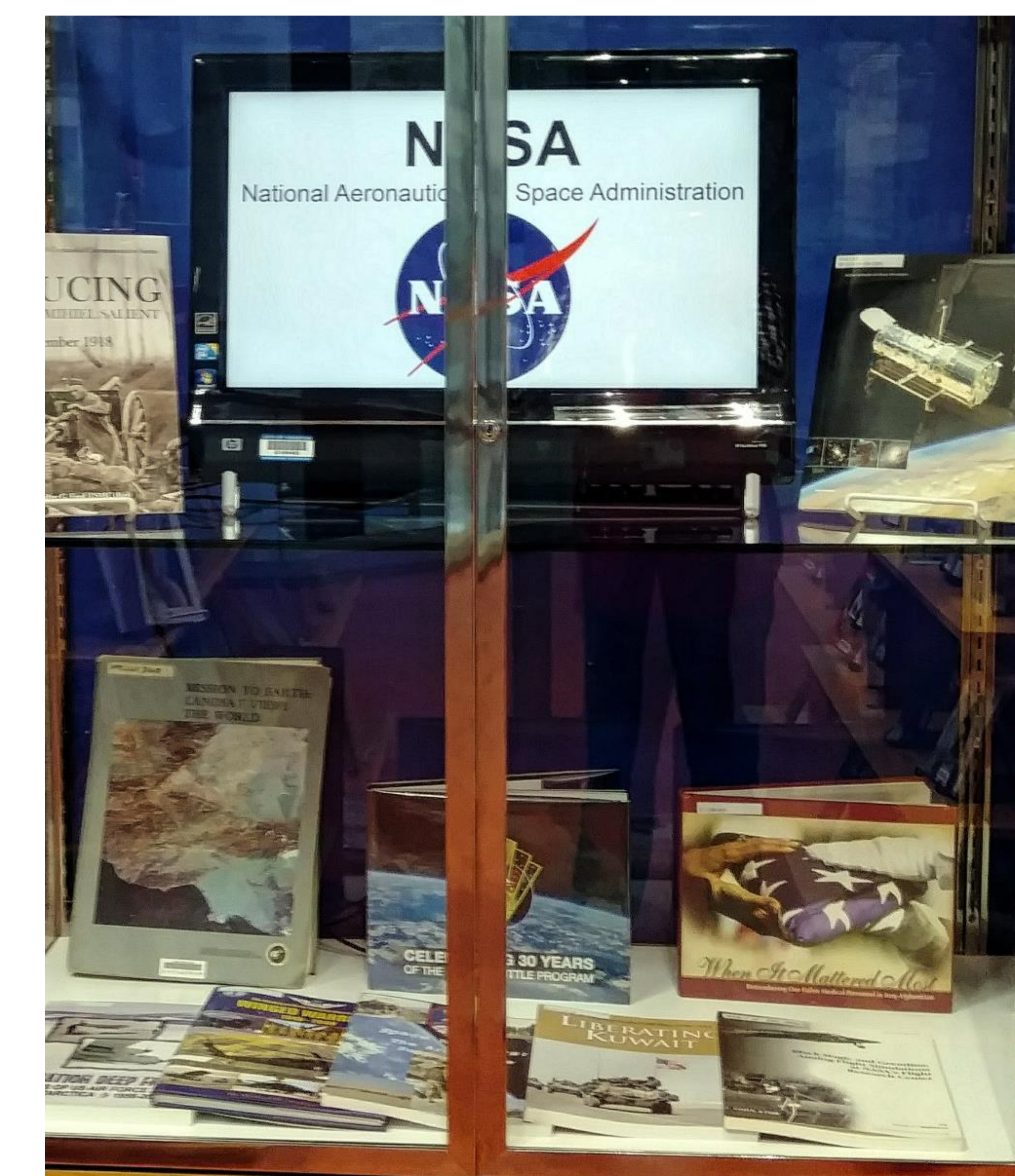
Showcasing government resources for the public with a display of books, flyers and posters.