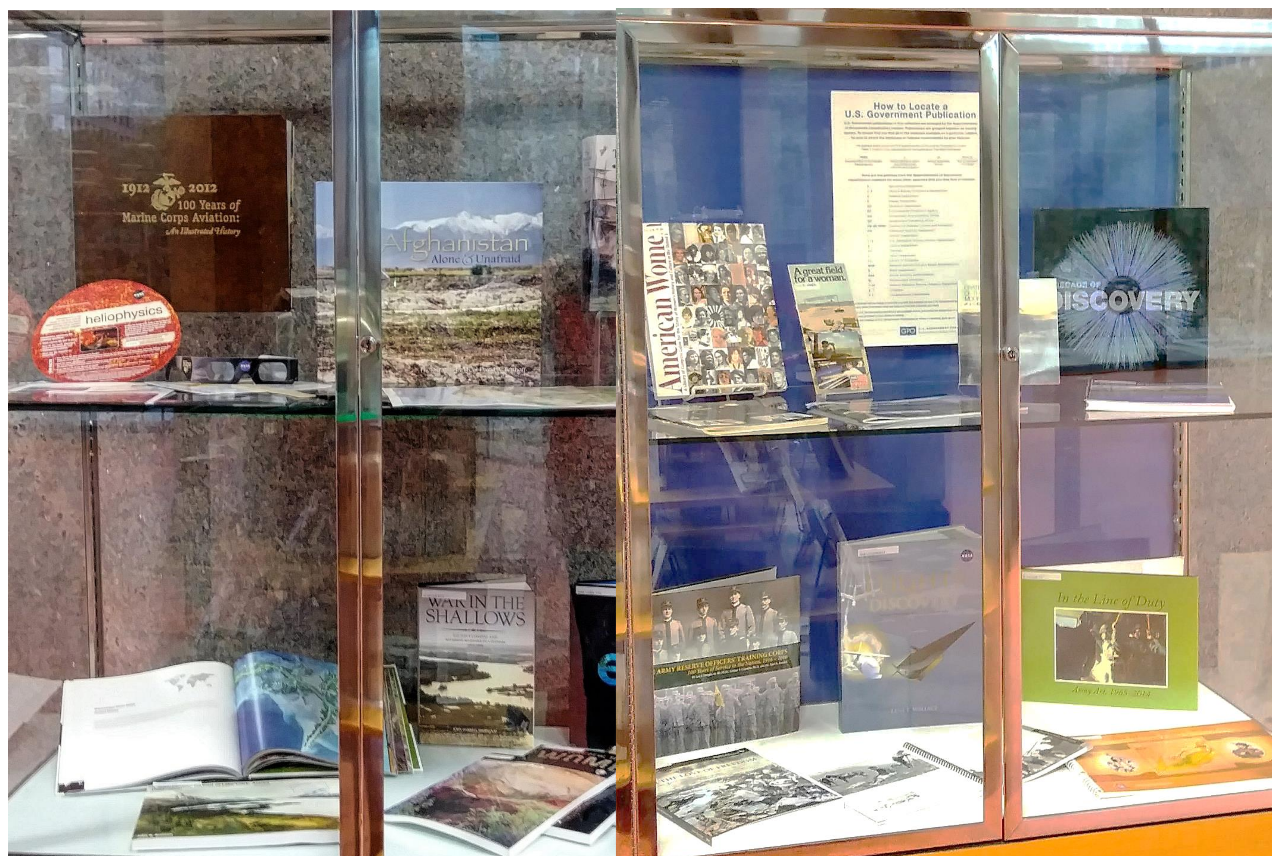
HPL's 135 years in FDLP: Highlighting books, posters & other items published by the GPO on history, military defense & NASA