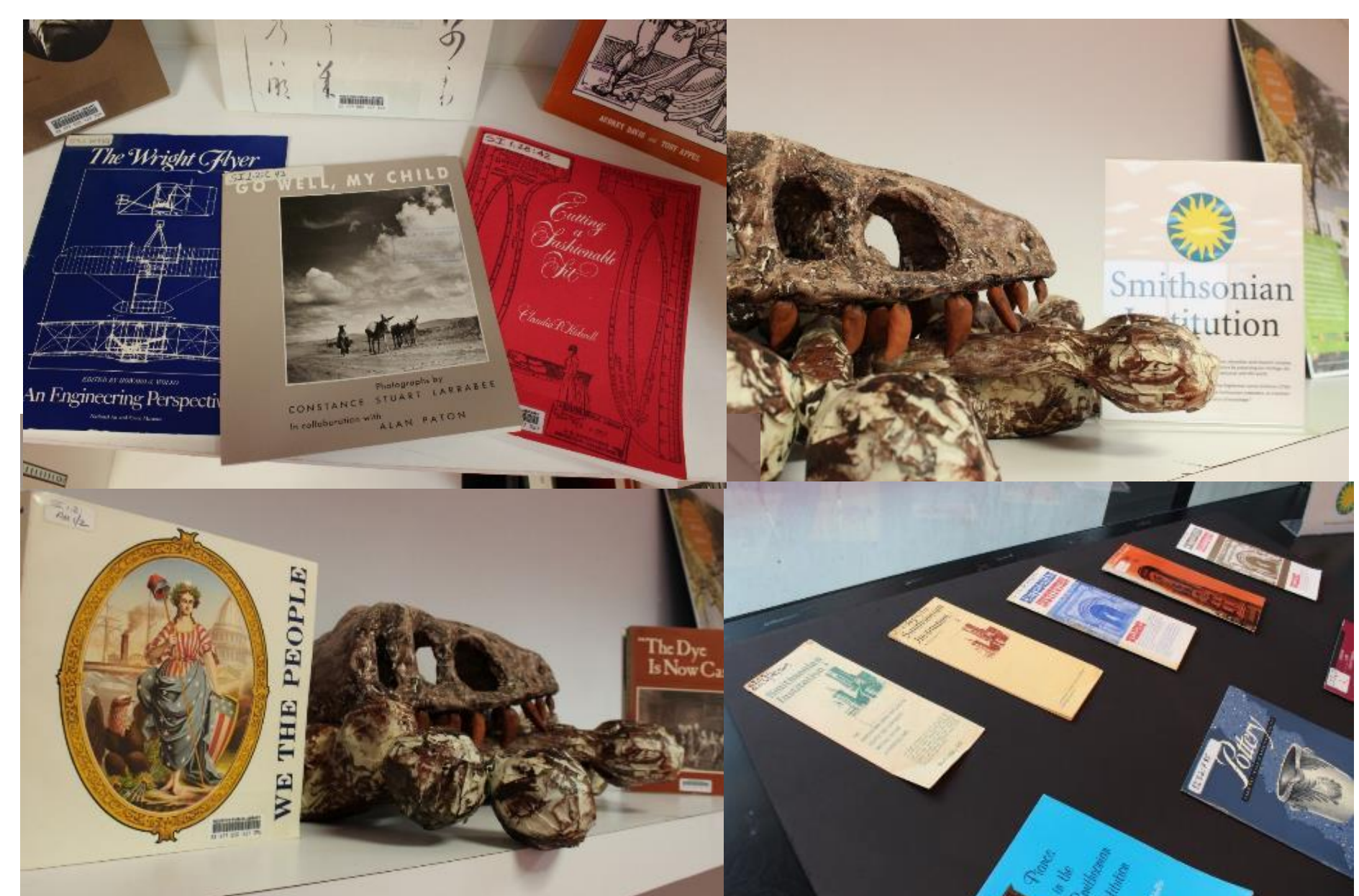
Great Smithsonian exhibit shared with our community