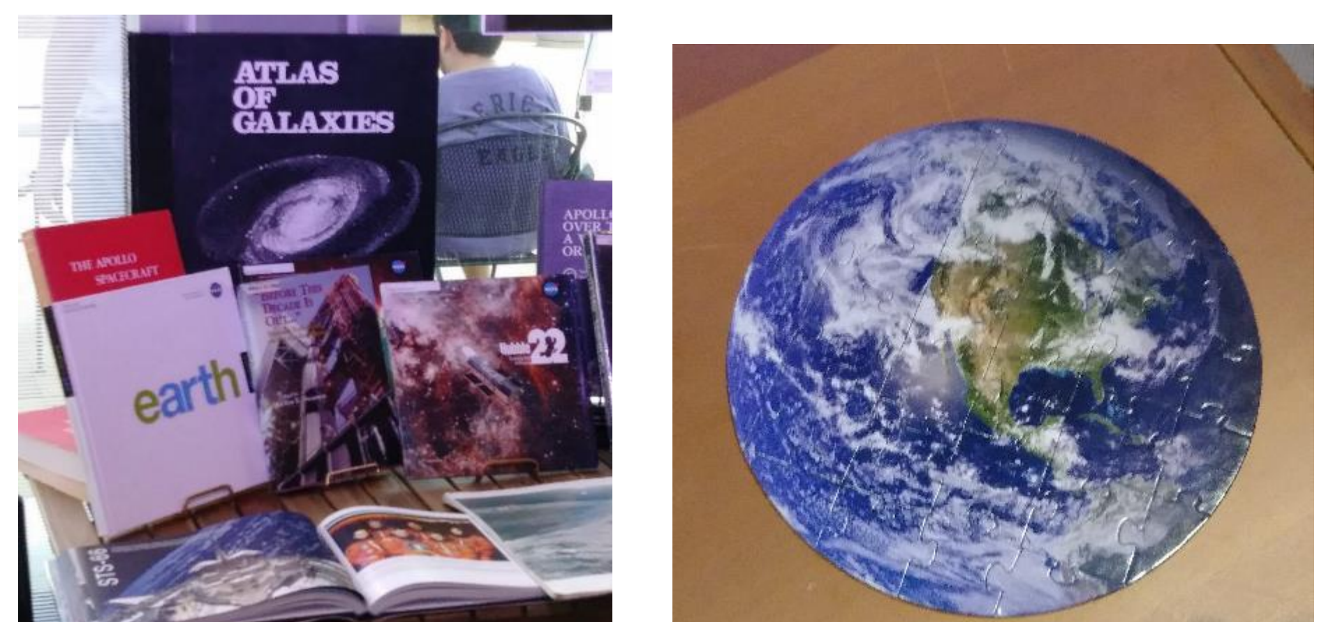
50 th anniversary of the Apollo 11 Moon Landing, on July 20, 2019