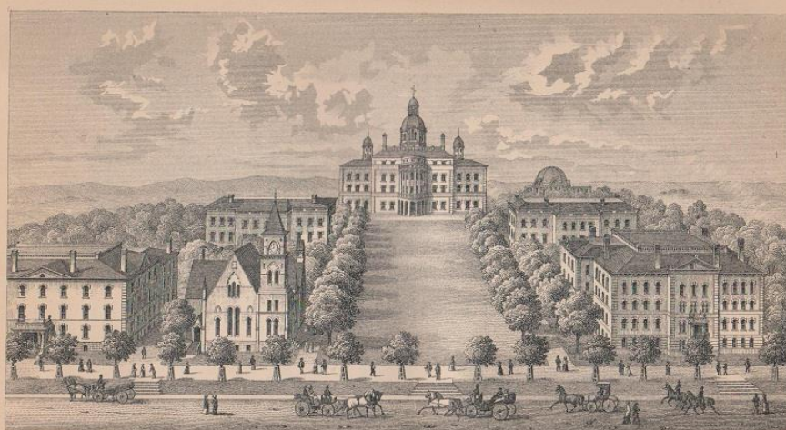
STATE UNIVERSITY, MADISON.