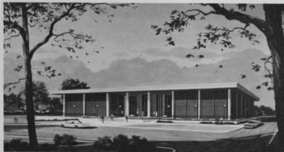
Architect's Drawing of New Library

1969 Southwestern Oklahoma State College Library became Al Harris Library with the opening of the new library building. New building was built just south of the original library and is significantly larger.