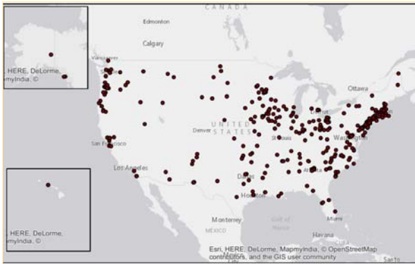
Total Registrants by Location