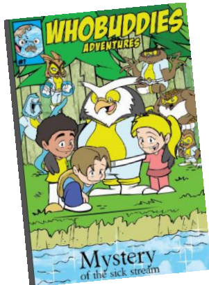
Comic books, strips, etc.