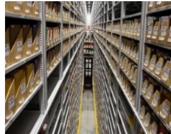
Research Collections and Preservation Consortium (ReCAP)