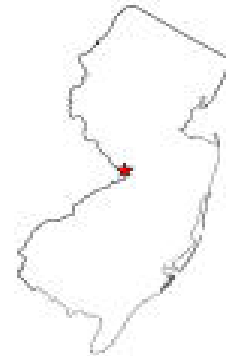
New Jersey - The Garden State