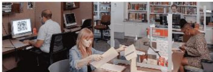
Researchers working with VHP collections in the American Folklife Center Reading Room.

Thanks to the generosity of our participants, the Veterans History Project archive includes thousands of personal narratives of individual veterans. These narratives take the form of oral history interviews as well as original manuscript material, such as memoirs, letters, diaries, and artwork, as well as original photographs.